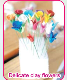
Delicate clay flowers