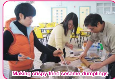
Making crispy fried sesame dumplings