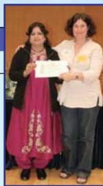
Presentation of certificates of appreciation