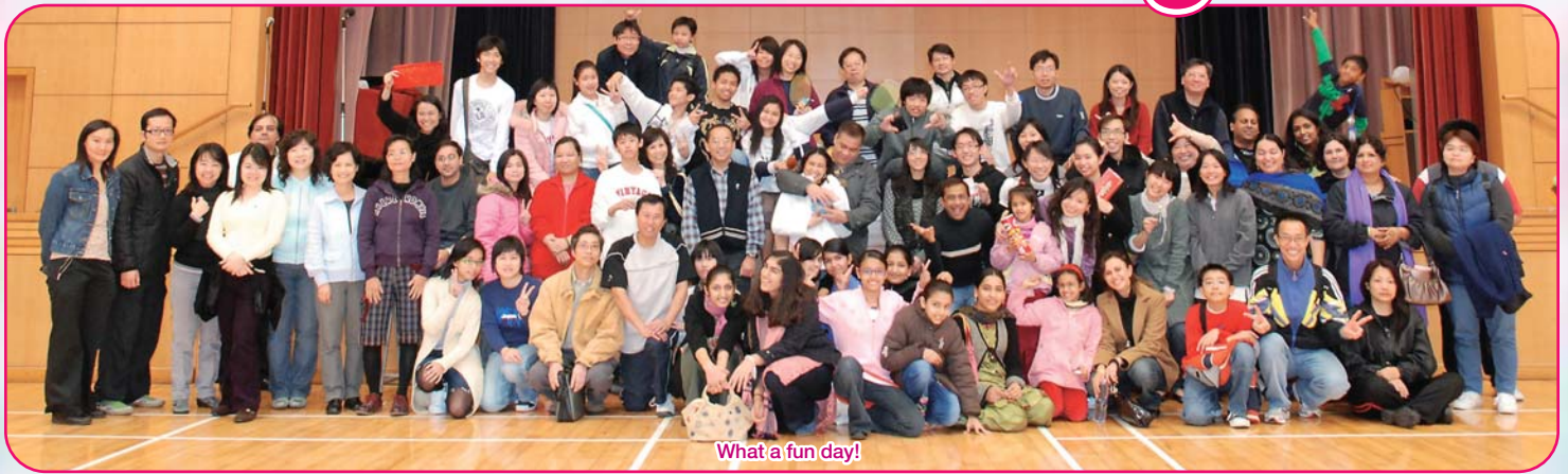
What a fun day!

“Deal! Deal! Deal!” “No deal! No deal!” chanted the participants. Where were they? At a casino in Macau? No! In the school hall thoroughly enwrapped in a gripping game of “Deal or No Deal”, which was the climax to a long, exhausting day of activities organized in the first ever PTA Fun Day.