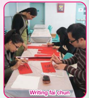
Writing fai chun